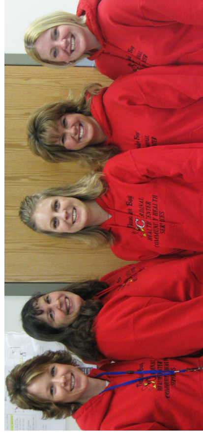
School Based Health Center Staff

Working together to prepare students for life